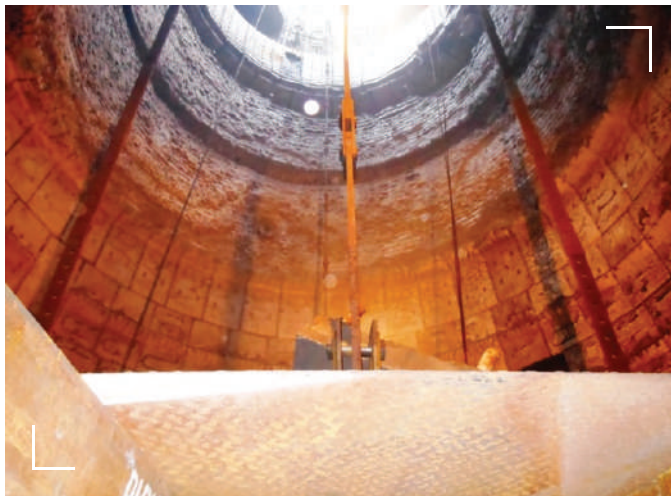
View of BF & platform assembly prior the repair