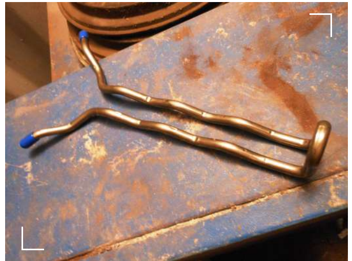
Anchors to be welded onto the staves