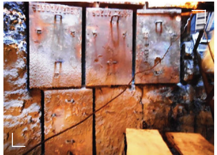
View of the stave replacement