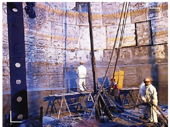
Operations for lining panelling & shotcreting application