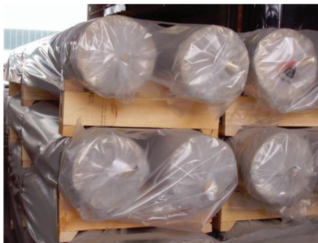
Fig. 2: Finished Lance Pipes

Calderys India optimizes the Lance design and Monolithic quality to meet customers' expectations. Tuyeres are the exit point for either powders or gases and its design, therefore, is crucial for Lance performance. Calderys India designs tuyeres taking the ladle size and its metal bath height into consideration, for best Lance performance.