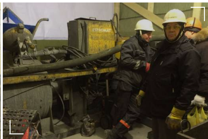
Following safety rules: correct PPE, heating fan to create positive temperature