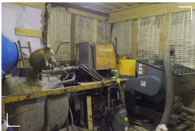
Compact arrangement of mixing and pumping equipment in temporary organised covered space

Project documentation like drawings, plan of job organization (the main document regulating project realization and its safety aspects), requirements and measures for works in severe winter conditions; executive project were developed by Calderys and agreed with NTMK.