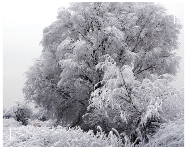
Winter in the Urals is a wonderland, unless you are trying to build a Greenfield blast furnace in -25°C

Another novel idea was having a truck-crane on the casthouse at all times, as well as providing helpers for big-bag operations to minimise the number of platform lifts.